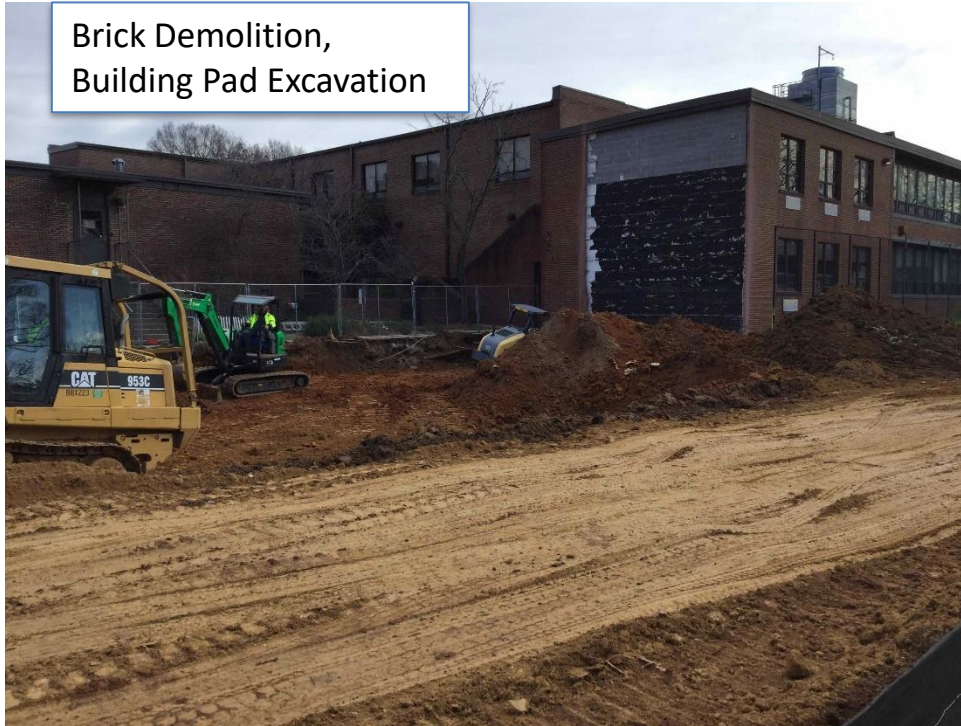
Brick Demolition, Building Pad Excavation