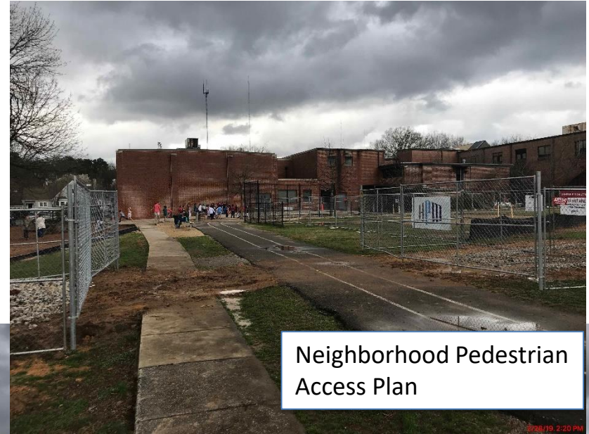
Neighborhood Pedestrian Access Plan